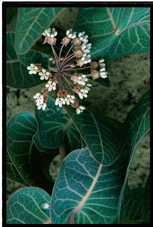
Sand Hills Milkweed

Range: In Georgia only known from Catoosa and Floyd County, rare